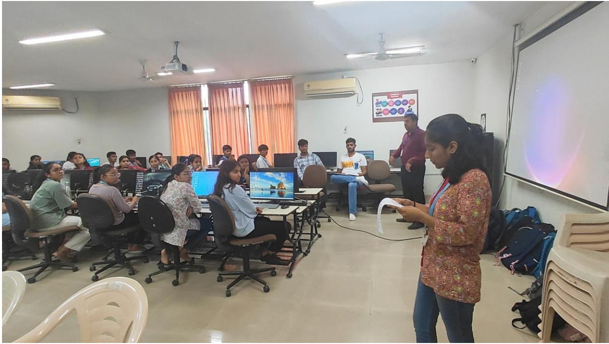
LR of Class gives essential aspects of three Laws(IPC, CrPc, Evidence Act)