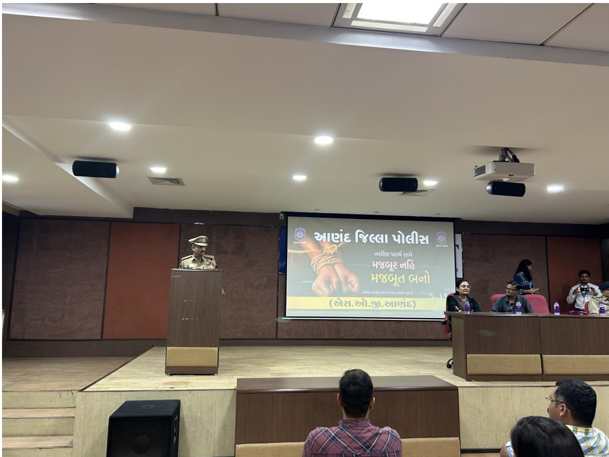
Superintendent of Police Officer of Anand Delivers sessions about three laws(IPC, CrPc, Evidence Act)