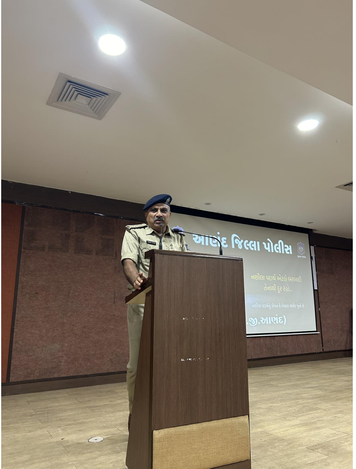
Deputy Superintendent of Police Officer of Petlad Delivers sessions about three laws(IPC, CrPc, Evidence Act)