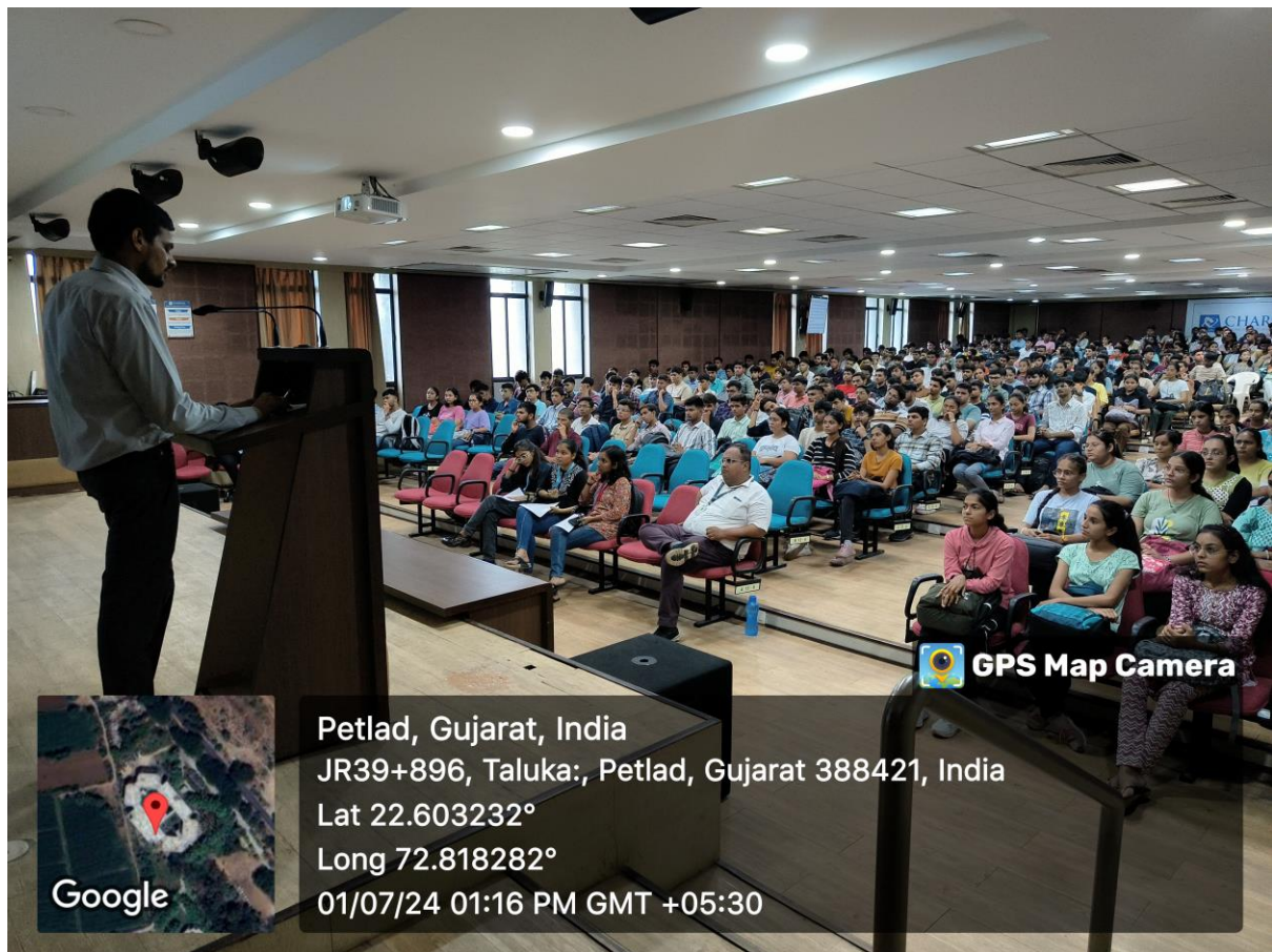
Assistant Professor and representative of Institute is delivering essential aspects of three laws (IPC, CrPc, Evidence Act) to students and teachers in Auditorium