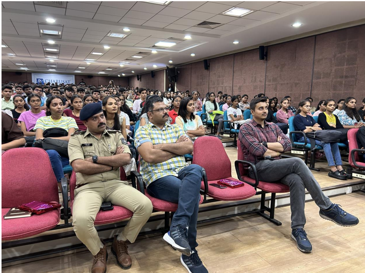
Audience listens sessions about three laws(IPC, CrPc, Evidence Act)