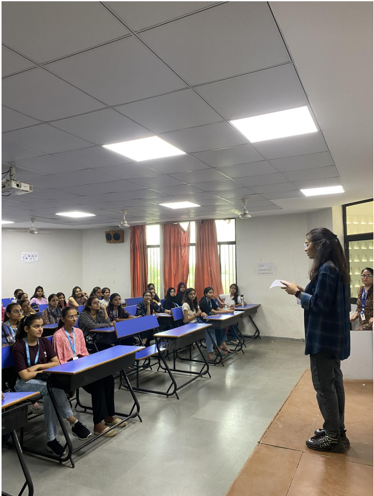
LR of Class give brief about three Laws(IPC, CrPc, Evidence Act)