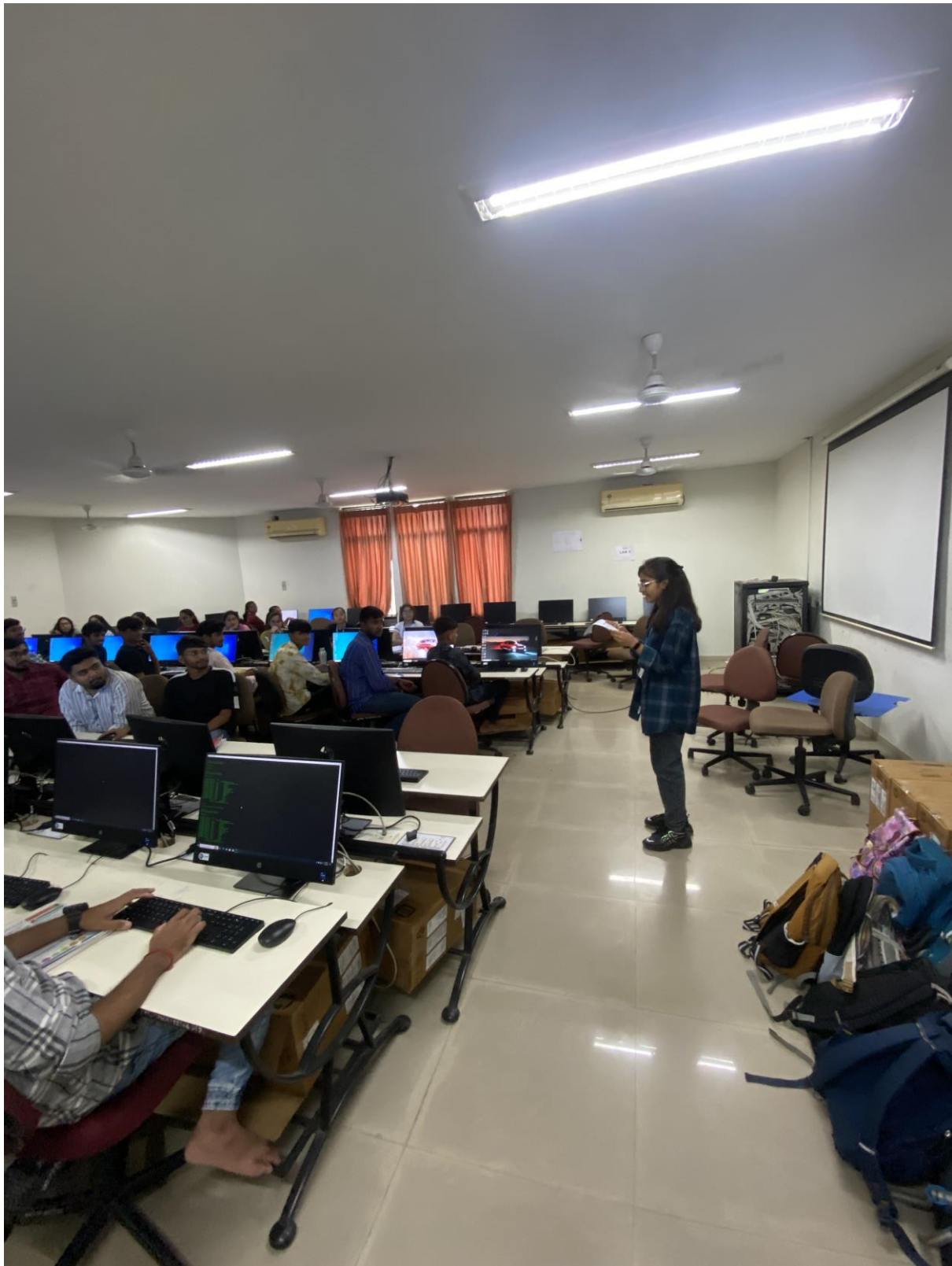
LR of Class discusses the three Laws(IPC, CrPc, Evidence Act) in laboratory